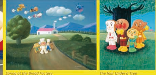
Spring at the Bread Factory

5 Anpanman Theater This theater shows episodes of the Anpanman animation series. The show features Anpanman's many friends and keeps you on the edge of your seat wondering what will happen next! Come take a break and watch if you get tired walking around the museum.