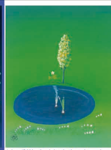
In beautiful May the wind rustles the newly green leaves

Poem and Märchen Gallery This gallery provides a window into the world of Takashi Yanase through his many contributions, which include cover art and illustrations created for Poem and Märchen magazine, as well as many of his poems and cartoons. The gallery also holds special exhibits two or three times a year. In addition to original drawings by Poem and Märchen artists, these exhibits showcase the works of picture book artists from Japan and around the world.