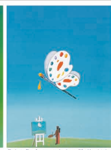
The butterflies of summer, such colors as if freshly painted