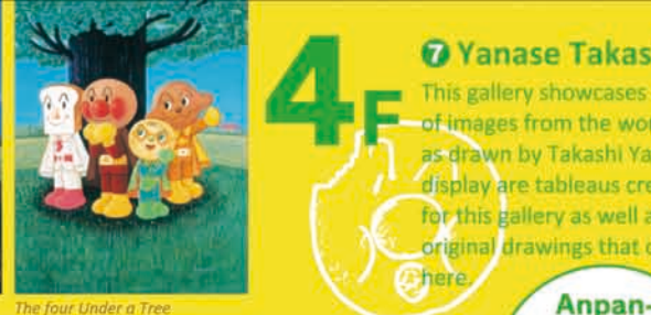
The four Under a Tree