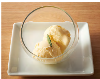
Garden Cafe Ritsurin Ice cream (Setouchi lemon, Sanuki strawberry, Takase tea, Utazu natural salt, Shodoshima Olive oil)

Please ask the staff for more details. ¥550