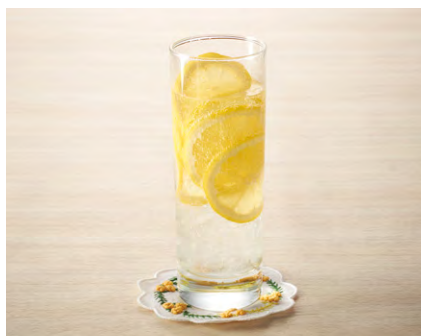
House-made Honey Lemonade Using Setouchi Lemons and Kagawa Honey