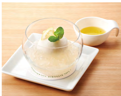
Sanuki Yasoba gelidium jelly with Setouchi lemon ice cream (with Honey flavored with Yuzu : Japanese citrus)