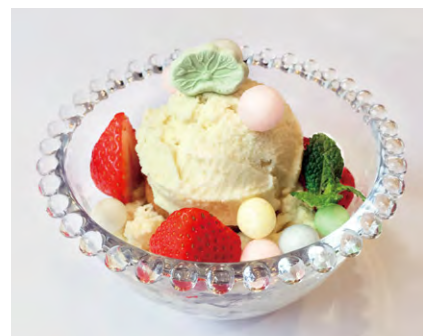
Shodoshima Olive Oil and Sanuki Wasanbon Parfait