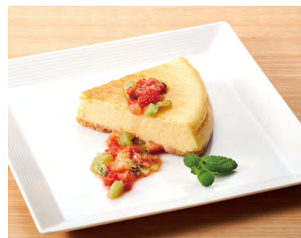
Sanuki's Omotenashi Dolce

Please ask the staff for more details. ¥550