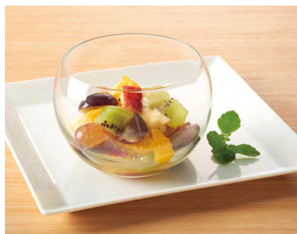
Seasonal Macadenia Fruit Salad with Rare Sugar Syrup