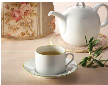
Shodoshima Olive Tea (Teapot)