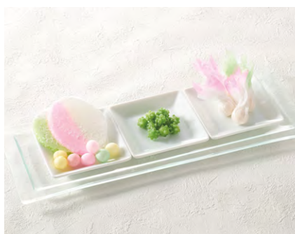
Traditional Kagawan Wedding Sweets

Please ask the staff for more details. ¥1,200