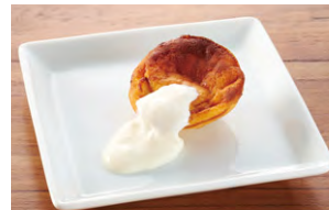
Dessert of the day