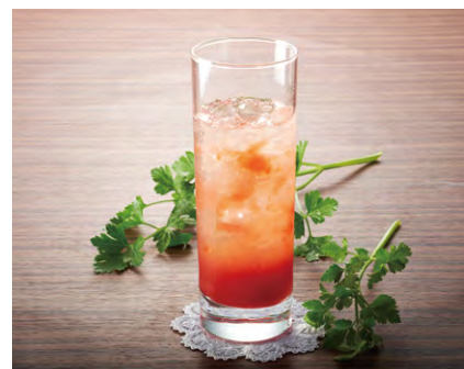
Kagawa Plum Soda