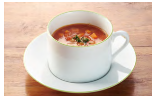
Soup of the day