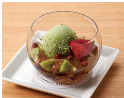
Sanuki Yasoba gelidium jelly and Takase Green tea ice cream (with brown sugar syrup)