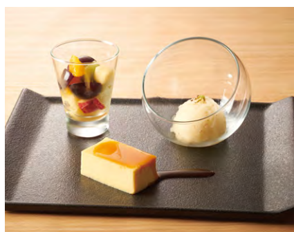
Sanuki's Omotenashi Assorted desserts

Please ask the staff for more details. ¥700