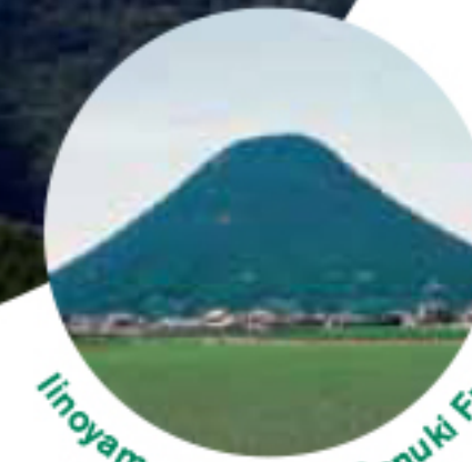
Inoyama Mountain (Sanuki Fuji)