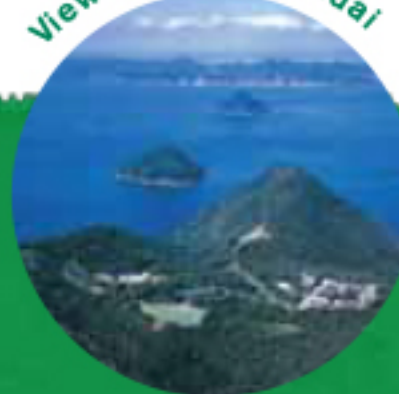
View from Goshikidai

It is not only a green tourism experience!