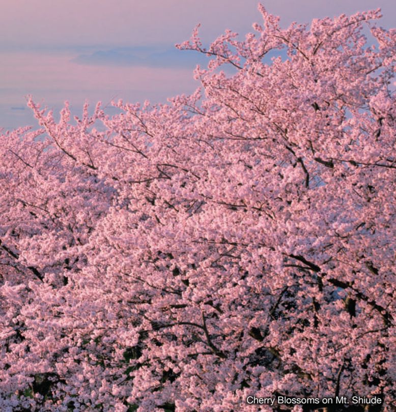
Cherry Blossoms on Mt. Shiude