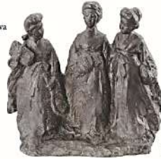
Works by artists from Kagawa Prefecture return to their hometown. 10