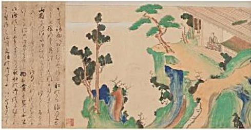
Sugawara no Michizane, Saigyō and other people from the past visiting Sanuki are depicted here. 8