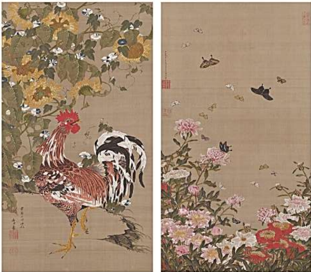
Capturing the essence of life, the true brilliance of Ito Jakuchu. 9