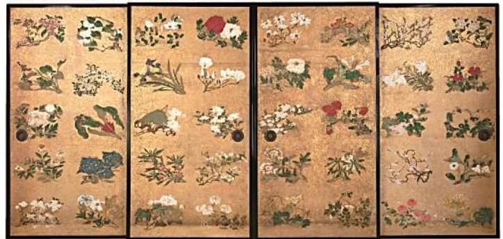
Flowers by Jakuchu, to be displayed outside Kotohira-gu Shrine for the first time after conservation. 12