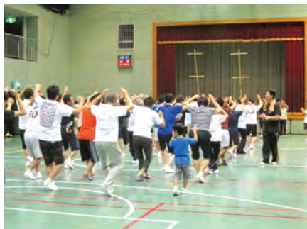
Master the Awa Odori (dance) to the zomekibayashi (musical accompaniment).