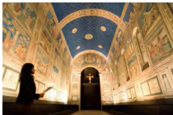
Local Reproduction of Scrovegni Chapel

Otsuka Museum of Art Tokushima-ken, Naruto-shi, Naruto-cho Tosatomarura-aza Fukuike 65-1 Place