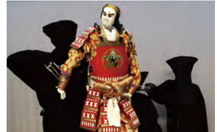
Five fingers manipulate the eyes and mouth, and the doll's expressions light up with life.