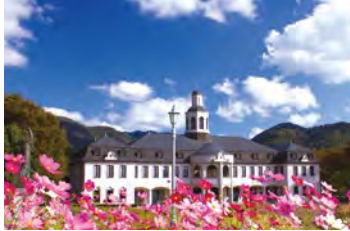
A variety of concerts are held at the Das Deutsche Haus Naruto.

Beethoven's "Ninth Symphony" In the land where the song premiered in Japan, sing a joyful song in chorus together!