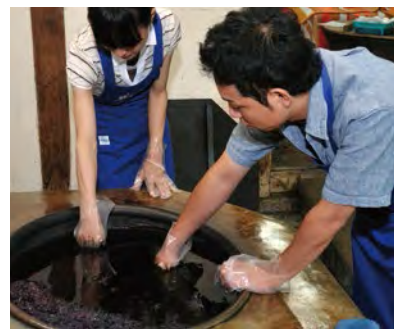
Learn from experts tying and dyeing techniques.

Each time you apply the indigo dye, the color deepens. There are 48 named colors, including "light indigo," "flower blue," "navy," etc.