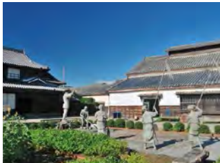
Ai no Yakata (House of Indigo) is an old mansion that remains from the indigo trade.

Indigo-dyed crafts using Awa's indigo. Everyone's efforts will be in dyeing a "Japan Blue" tapestry.