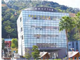
At the foot of Mt. Bizan is the Awa Odori Kaikan Museum.

Awa Odori is one of Japan's 3 largest festivals. Become "dancing fools" together, and move and shout together with your hearts in unison!