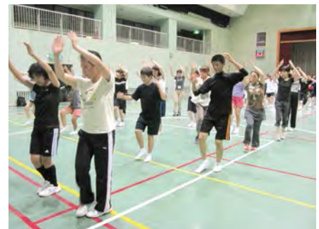
Personnel provide a definitive lecture on the topic.