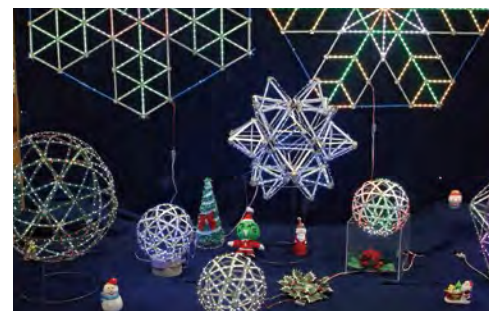
Craft dazzling, original light displays from LEDs. While improving mutual sensibilities, you can experience the happiness of creating something together.