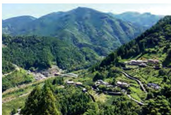
Japan's Surviving Traditional Landscape of Sora No Sato

In the rustic, traditional Japanese landscape spend time enjoying a rich country lifestyle that shifts along with the seasons.