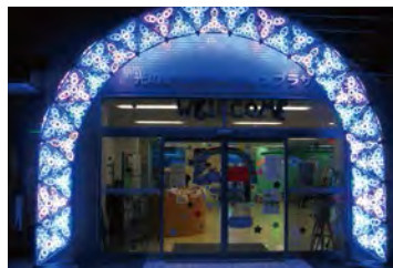
State-of-the-art LEDs are gathered at Hikaru no Machi Station Plaza, and have been

This tremendous invention is changing the future! In the birth-place of the "blue LED" let's create LED art.