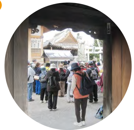
Walking together will deepen a team's bonds.