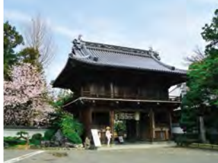
The 88 temple trail is roughly 1460km, and begins with Ryozen Temple.

Get away from the hectic life of the day-to-day, and simply walk in prayer or contemplation to search for something truly important.