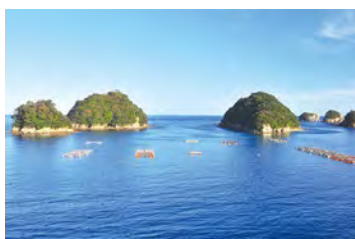
The ria coastline forms a beautiful river valley.

Shishikui Fishing Port Tokushima-ken, Ama-gun, Kaiyou-cho, Shishikuiura Place