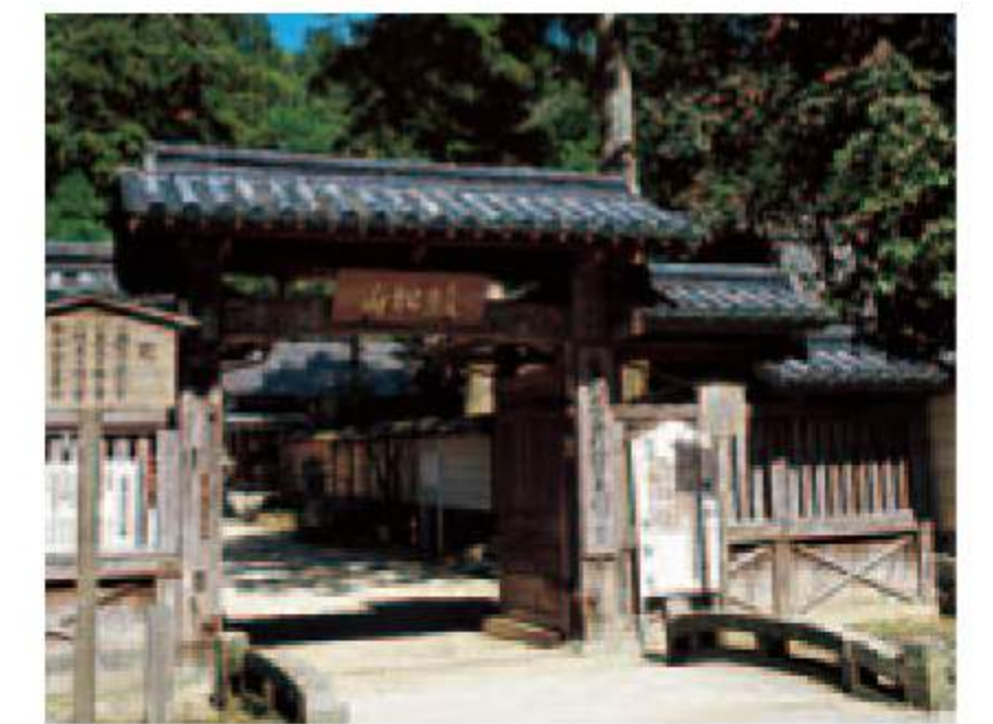
The Shiromineji Temple