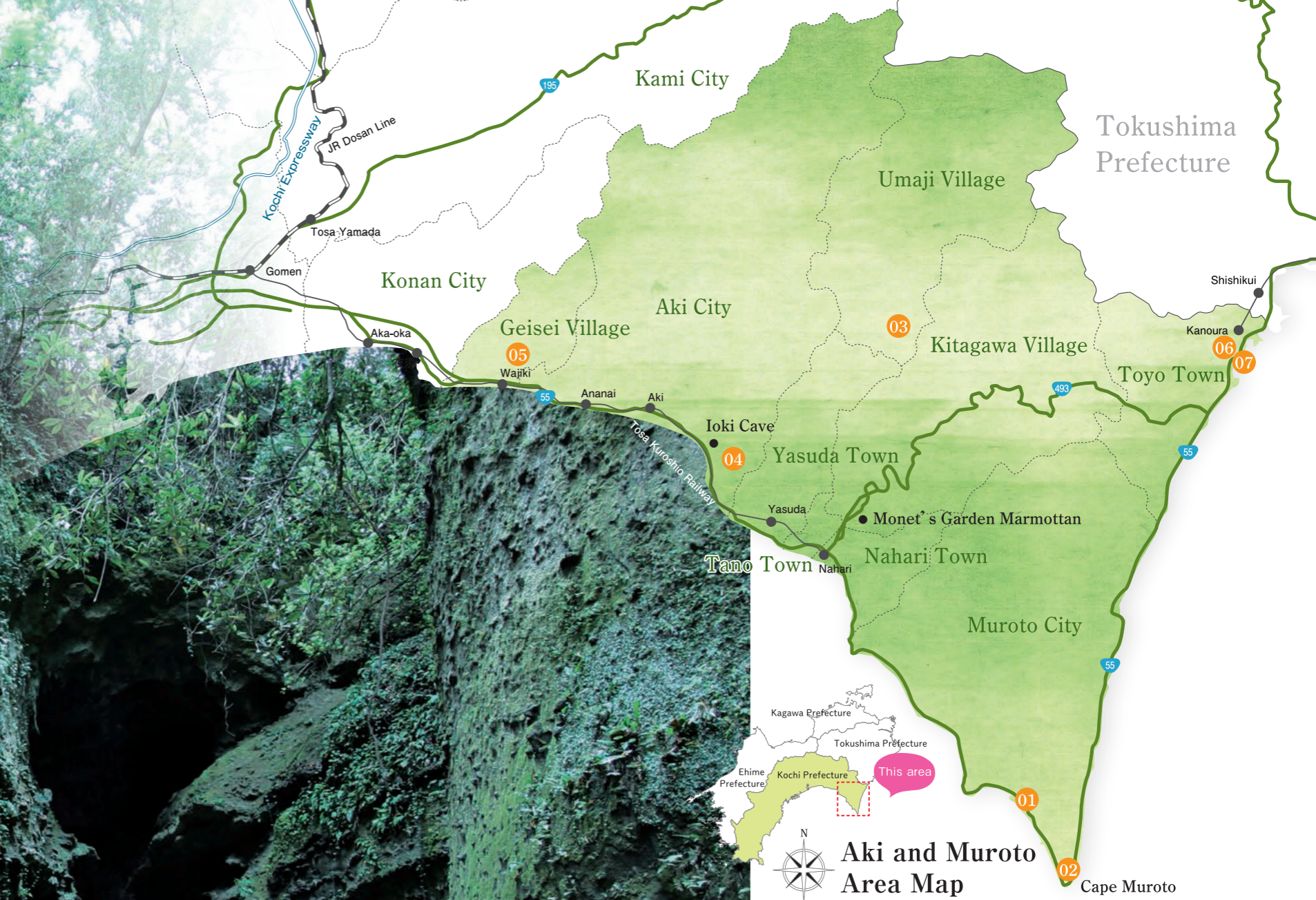
Aki and Muroto Area Map

Embrace the magnificent view created by Shikoku's abundant nature!