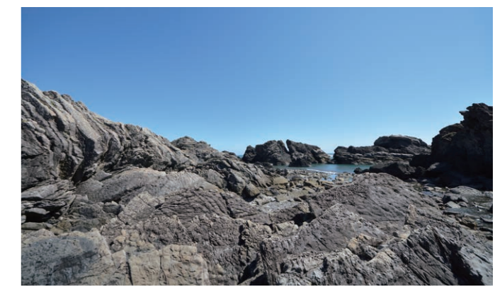
Muroto UNESCO Global Geopark