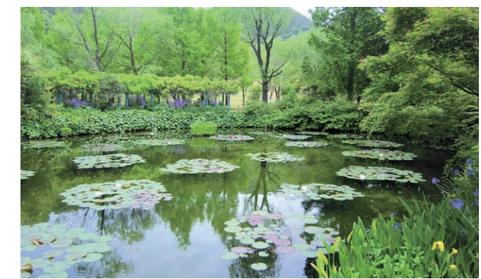
Monet's Garden Marmottan in Kitagawa Village