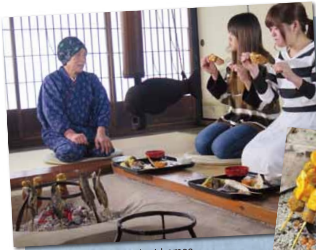
Local dishes eaten at ancient homes