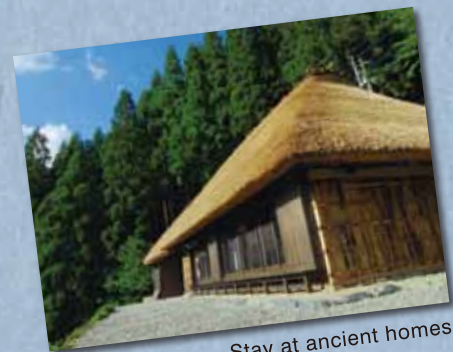
Stay at ancient homes