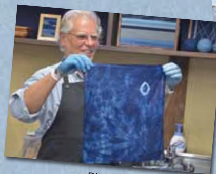
Blue dyeing experience

Approximately one hour by car from Tokushima Airport, luxurious stores built in the 19th Century line the streets of Udatsu in Waki, which prospered as an area of blue dye production. Create unforgettable memories by spending a fulfilling time in agricultural experience at the sloped fields of Sarukai village, which is on a 40-degree slope, or by spending a relaxing time at the well-maintained ancient homes built hundreds of years ago.