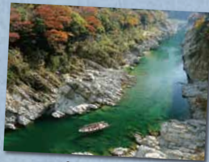
Sightseeing pleasure cruise