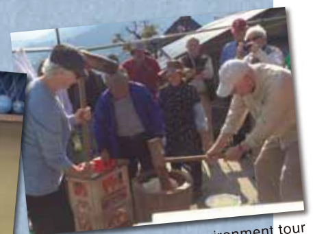
Western nature environment tour