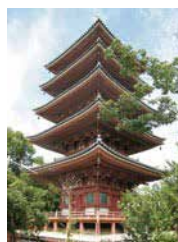
■ 五重塔 Five-storied Pagoda