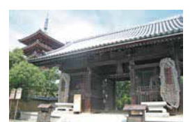
■ 仁王門 Niomon Gate