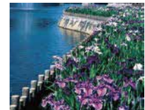
シヨウブ Japanese irises