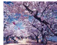
桜 cherry blossoms