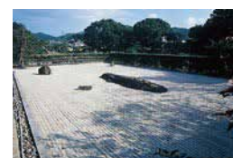
■ 無染庭 Musentei Garden